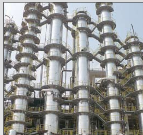
KBR's phenol technology team provides services to clients including technology licensing and support in the initial planning phase of projects, through process design, engineering and construction of phenol plants.